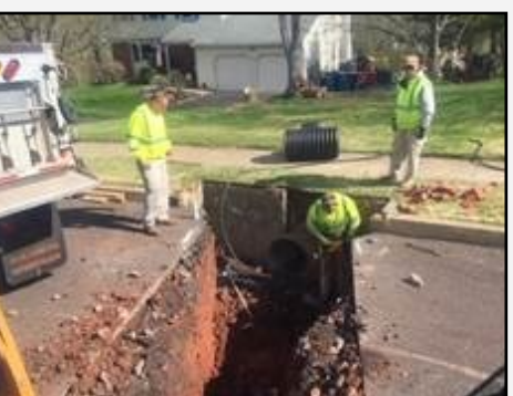
Public Works crew during Hunter Hill stormwater work

• During 2017, the Township replaced all of its "cobra-head" style street lights with LED lamps resulting in a significant reduction in operation and maintenance costs.