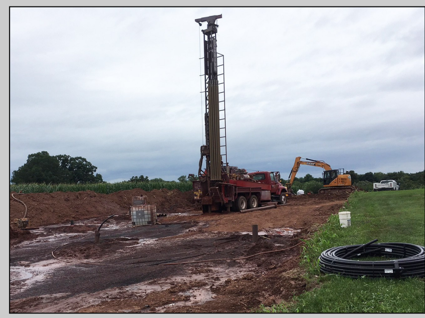
Active work zone within the well field of the future geothermal system

The Township's geothermal HVAC project began this summer with staging, mobilization of equipment and well drilling to the field located behind the Municipal Complex. The full scope of work will continue through the fall with the anticipated completion to coincide before winter temperatures set-in.