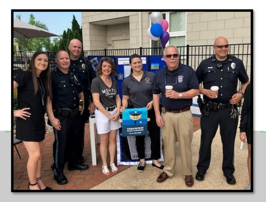
Coffee with the Cops Poolside at AVE Apartments. Members of the police department enjoyed meeting with residents during the AVE Apartments event on May 26, 2018.

EMERGENCY DIAL 911 Non-emergency Police Calls 215-368-7600 Police Administrative Office 215-368-7606