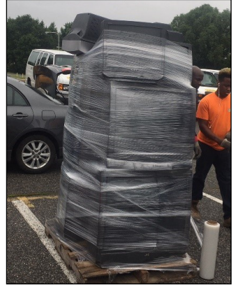
A palette of old TVs collected

The Township was happy to provide this service to residents and small business owners. The EAC is already planning for next year's collection event.