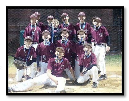
11U Travel Team

You can follow the Towamencin Connie Mack program on Twitter @TowamencinCMB