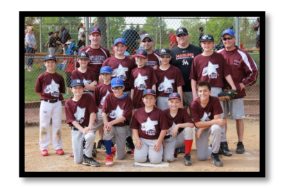
All Star Day